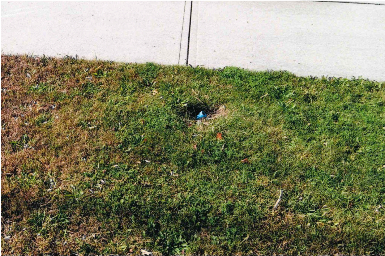
B&L SEWER PROJECT