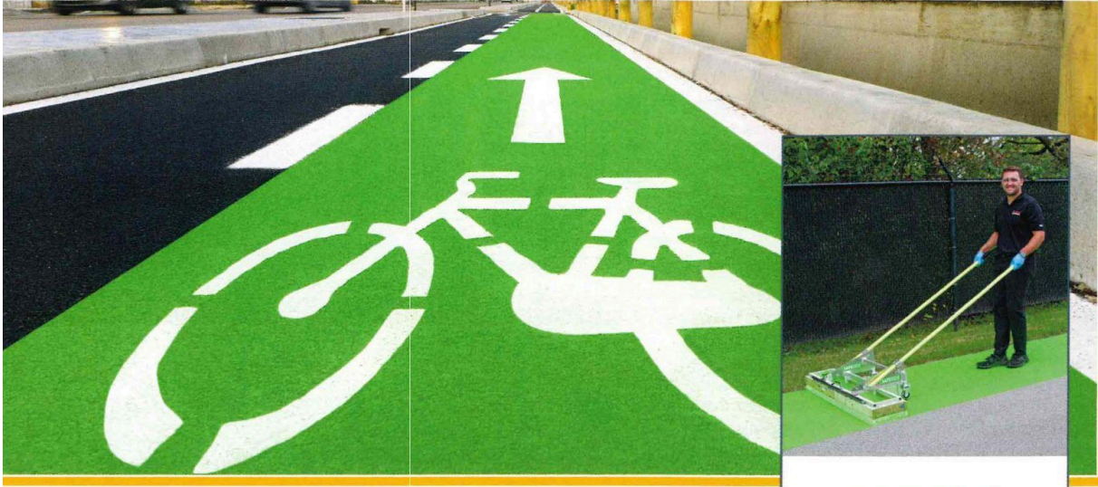
SAFE RIDE APPLICATION KIT AVAILABLE ON PAGE 83