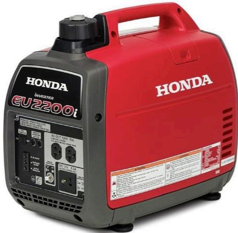
Click over image to zoom in