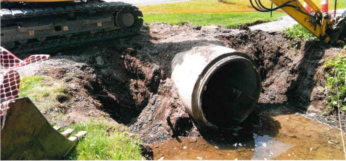
Washington Street Bridge Project