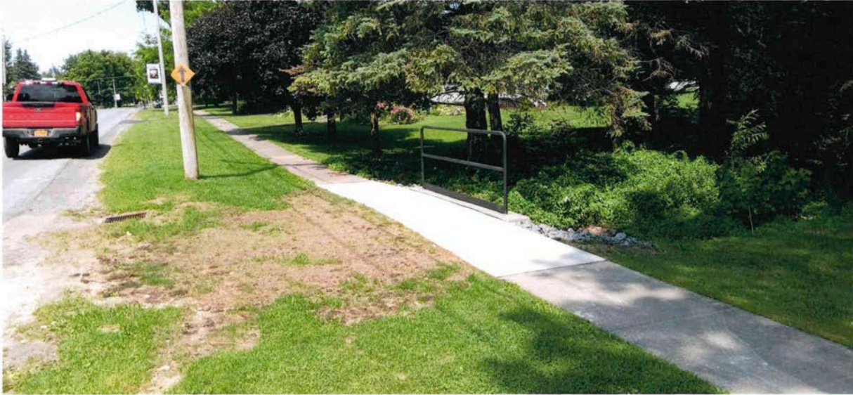
Washington Street Bridge Project