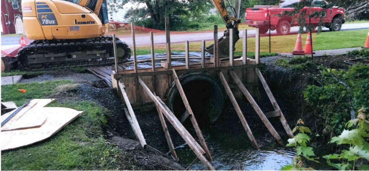
Washington Street Bridge Project