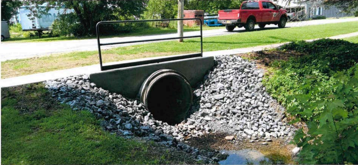
Washington Street Bridge Project