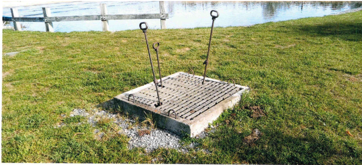
S.T.P. Secondary Flow Control Chamber Open Grid