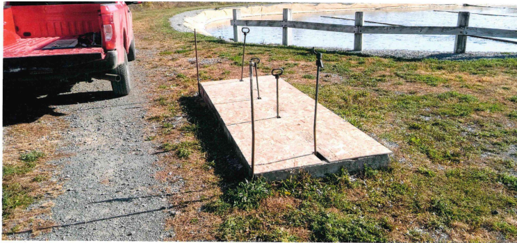
S.T.P. Main Flow Control Chamber Covered