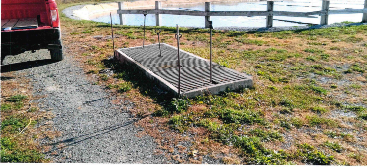
S.T.P. Main Flow Control Chamber Open Grid