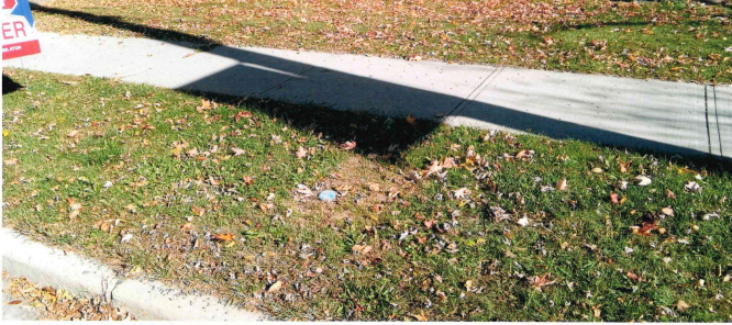
Curb Stop Required 16516 St 12, Vincent