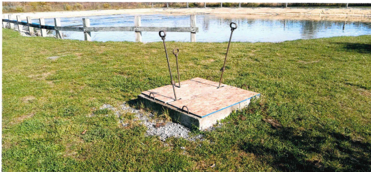
S.T.P. Secondary Flow Control Chamber Covered