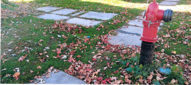
Curb Stop Required 2970 Cataract Street, Brantford